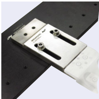
C665 700 ICS Adapter A/B

Basic element for direct mounting on machine table for accommodating the clamping elements of Series A and B. The low overall height allows optimum utilisation of WEDM technology when machining miscellaneous small items.