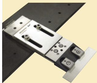
C 577 200 ICS Side clamps A (20-40)

Clamp for holding thin plates with contact lip at zero height. A 4 mm-thick shim can be inserted between the adaptation faces for collision-free clamping.