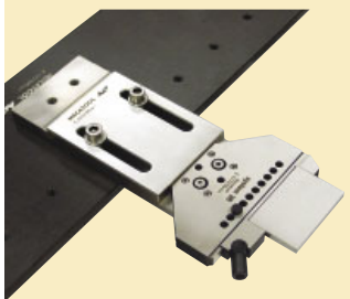
C 550 670 ICS Double clamps A (5/80)

Horizontal vice with overall height 13 mm. Suitable for workpieces machined parallel and rectangularly.